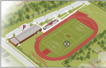
To Athletics Complex—two blocks from campus, on Fourth Street